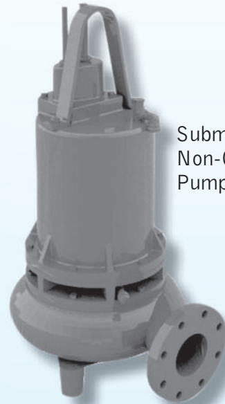
Submersible Non-Clog Pumps